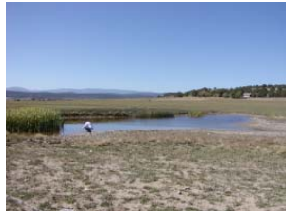
Tommy Evans sampling surface water within eastern plains region of Gallinas Watershed.