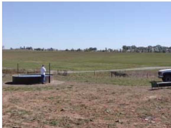
Tommy Evans sampling groundwater from shallow well within eastern plains region of Gallinas Watershed.

water quality at McCallister Lake, the largest surface water body at the Las Vegas National Wildlife Refuge. Data show elevated concentrations of calcium (402), sodium (1165), chloride (678), and sulfate (3525) as well as elevated conductivity and total dissolved solids.