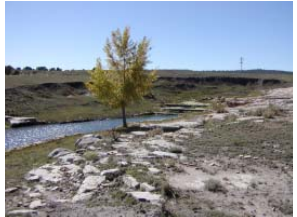
Spring-fed creek within eastern plains region of Gallinas Watershed.

This project analyzed the water chemistry at Las Vegas National Wildlife Refuge (LVNWR) holding ponds and groundwater seeps within the Gallinas Canyon. The study assessed the accumulation of dissolved minerals, salts, metals, cations and anions and their impacts on the stream habitat along the Gallinas River. The water source for LVNWR is diverted from Gallinas River, a tributary of the Pecos River Stream System and the sole source of usable water for the city of Las Vegas, which is experiencing significant supply and water quality problems. The primary objective was to examine the changes in water quality along a groundwater flow path that originates within LVNWR storage reservoirs before surfacing as seeps along the Gallinas River.