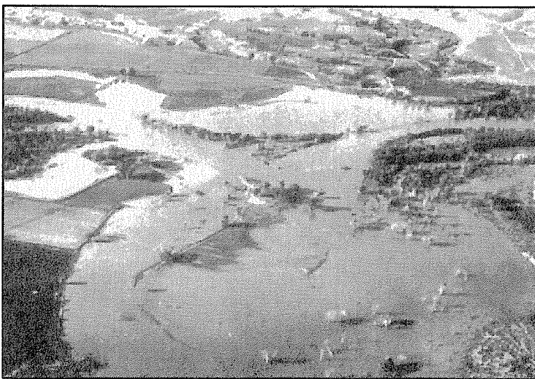
Figure 2. Flooded bottomland, Gunnison River, 1957.