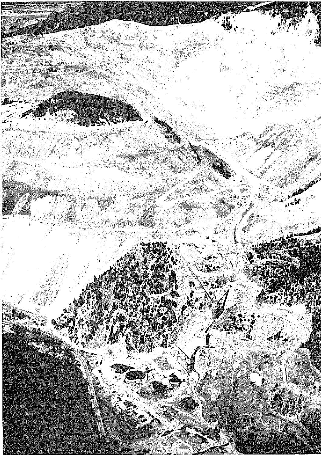
Fig. 2. Molycorp Mill and Open Pit Mine