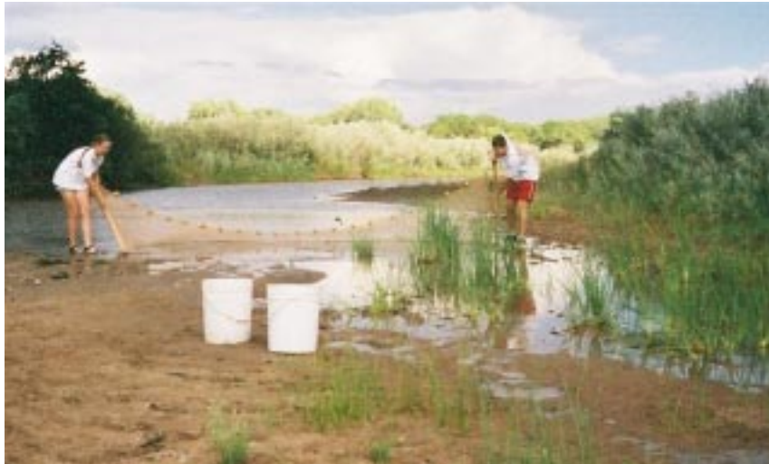
Eastern New Mexico University graduate students Jennifer Buntz (left) and Tony Spitzack (right) collect mosquito fish on the Pecos River during the summer of 2004.

Since females participate actively in the probability of success of a given male, sexual selection is occurring as active sexual selection rather than passive sexual selection.