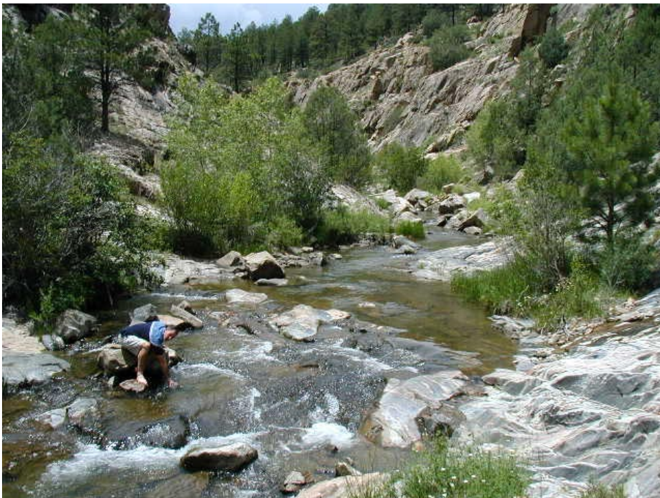
Greg Huey takes a grab sample at the Montezuma Monitoring Site during the summer of 2004.